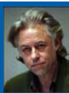
Guest Speaker: Sir Bob Geldof