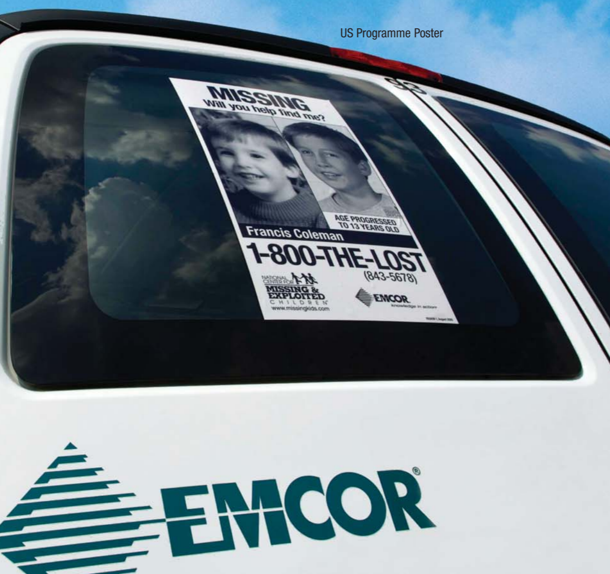
US Programme Poster

→ Online - The initiative goes on-line at www.emcoruk.com/about/kidsafety , where the child of the month will be featured along with information about the programme and a special child safety brochure. Children will also be able to take the KidSafety Challenge and be issued with a certificate which can be printed or downloaded for children to read and keep.